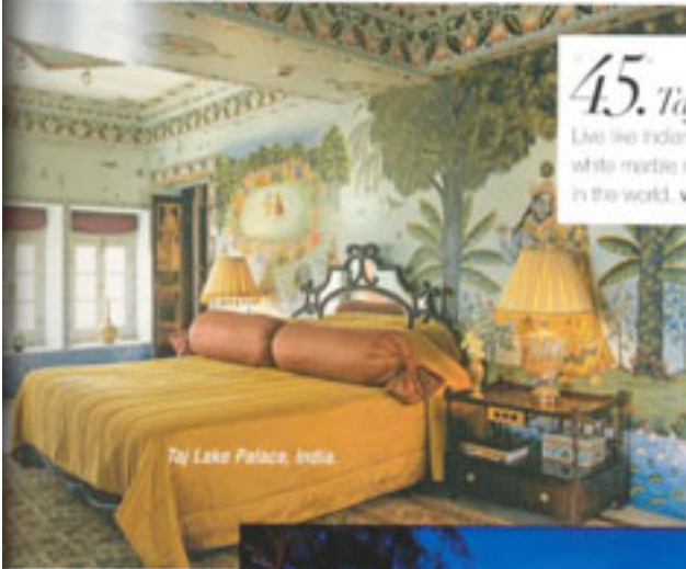
Taj Lake Palace, India