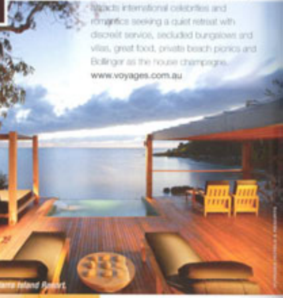
A private deck at Bedarra Island Resort.

This luxurious Great Barrier Reef hideaway attracts international celebrities and romantics seeking a quiet retreat with discreet service, secluded bungalows and villas, great food, private beach picnics and Bollinger as the house champagne. www.voyages.com.au