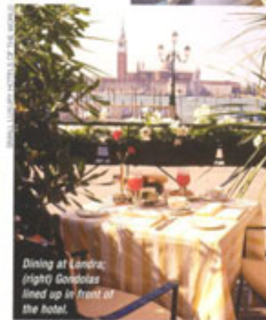
Dining at Londra; (right) Gondolas lined up in front of the hotel.