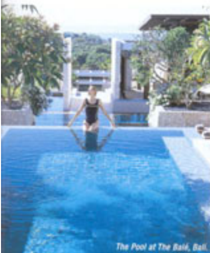
The Pool at The Bali, Bali.

Right on our doorstep, Bali has long been a favourite with Australians. Some of the superb resorts here are world besters. Try The Bali (below) at Nusa Dua ( www.sih.com/thebali ), Puri Wulandari ( www.puriwulandari.com ) and Amandari at Ubud ( www.amarresorts.com ).