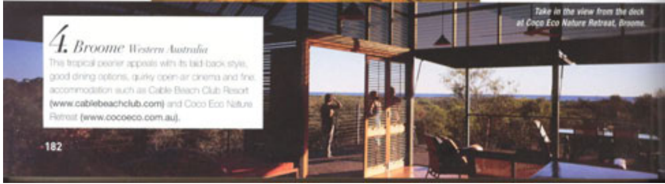
Take in the view from the deck at Coco Eco Nature Retreat, Broome.

The tropical coast appeals with its laid-back style, good dining options, quirky open-air cinemas and fine accommodation such as Cable Beach Club Resort ( www.cablebeachclub.com ) and Coco Eco Nature Retreat ( www.cocoeco.com.au ).