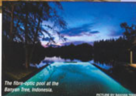
The fibre-optic pool at the Banyan Tree, Indonesia.

Enjoy romantic dinners on the beach; indulge in a unique one-night Spa Ryoken of absolute pampering and bliss at spectacular sunsets from an Indonesian-style villa on this island resort, 45 minutes by catamaran from Singapore. www.banyantree.com